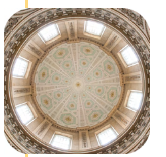
University of Oxford

Provide leadership to the sector and to use our influence to shape the conversation within and beyond our community, locally and internationally.