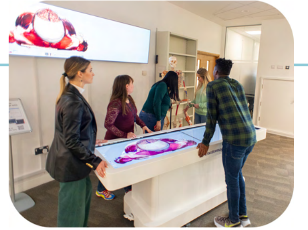
Weston Library at Bournemouth University