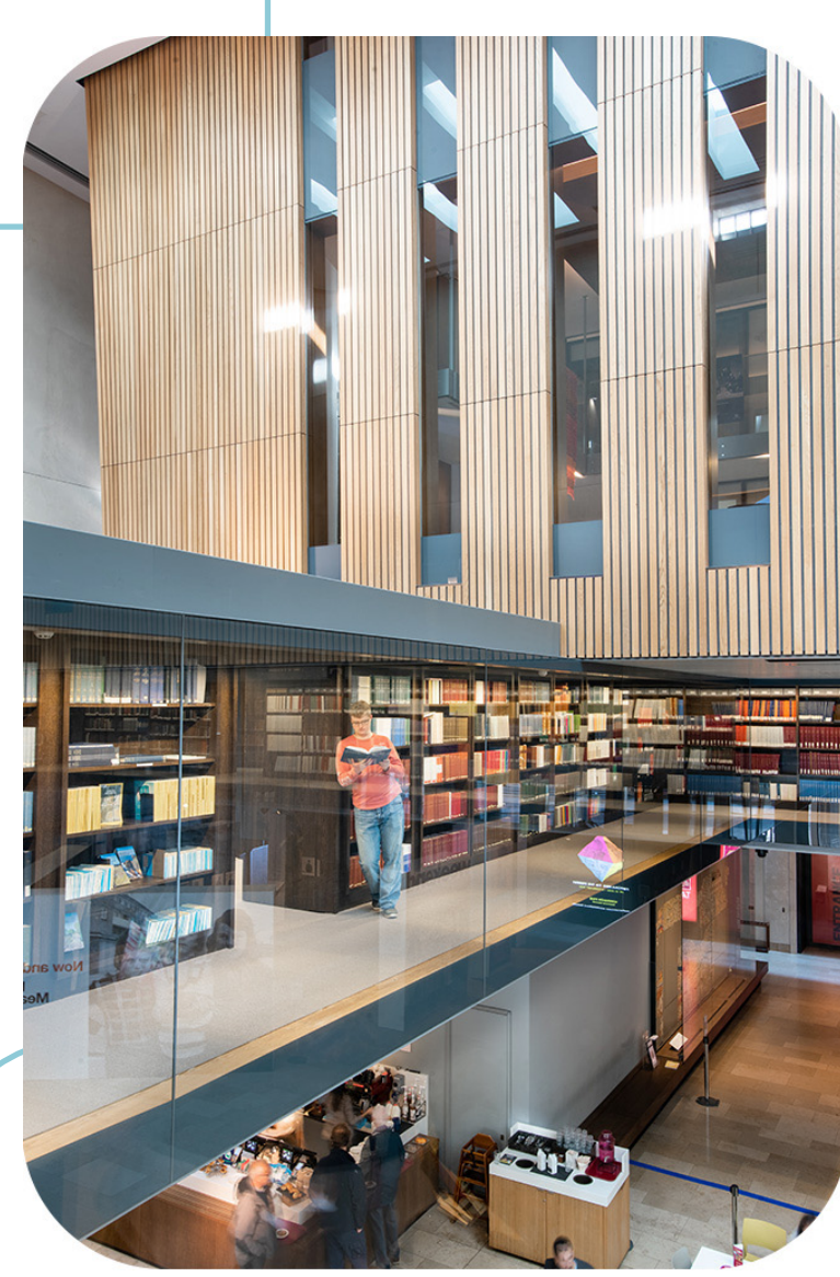
Weston Library at University of Oxford